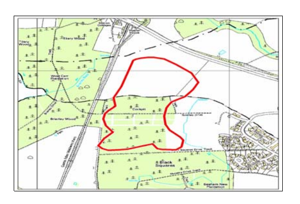
Land at Wynyard (Masterplan site 1)